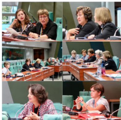
Petra De Sutter, former Chair of the SWWG from 2015 until 2018

"Women can play a crucial role in their political group. By organising ourselves, and identifying gender sensitive and gender related issues on the forehand, we can make a difference. Especially for those women across Council of Europe Member States who are struggling for their sexual and reproductive rights. They count on us."